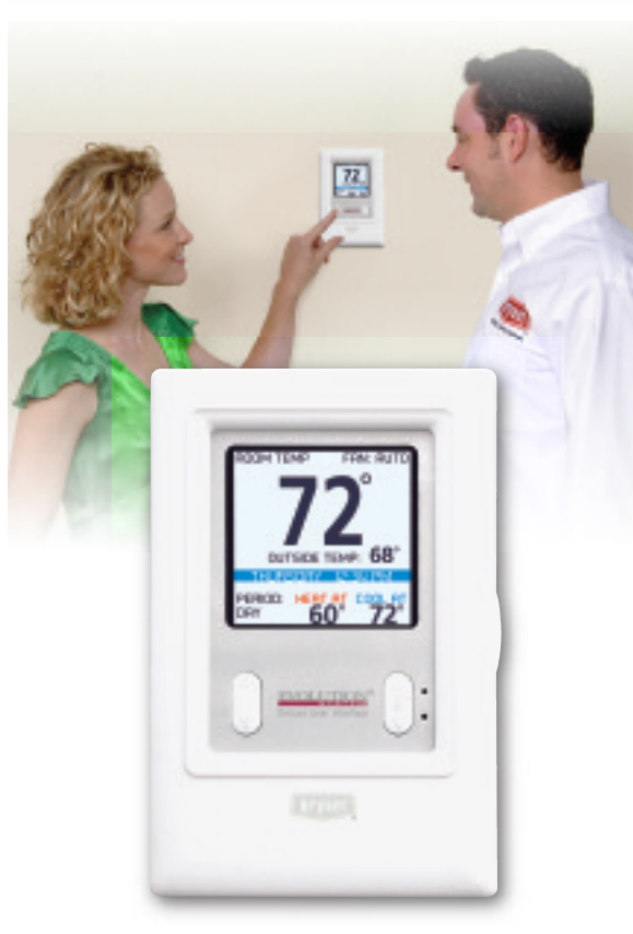
The optional Evolution<sup>®</sup> Control is much more than just a thermostat. It is your single source of precision temperature, humidity and indoor air quality.

Simple, intuitive and powerful, the Evolution<sup>®</sup> System truly sets a new standard for excellence in home comfort.