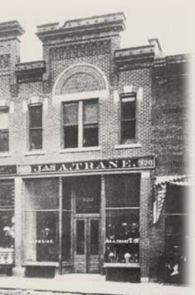
Trane Storefront La Crosse, Wisconsin 1891

using uncompromising quality, innovation and reliability. Today, their legacy is found in everything Trane makes, from our premium materials to our industryleading technology to our extensive product testing under the harshest conditions. When you buy a Trane, you're